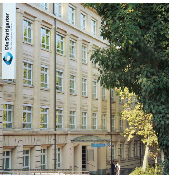
Company headquarters